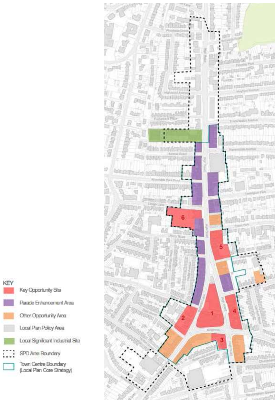
Map 2: North Finchley Town Centre SPD Spatial Approach